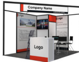
*Subject to change without notice